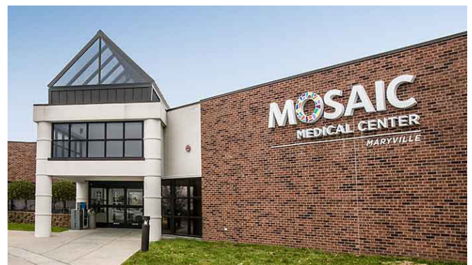
Mosaic Medical Center-Maryville