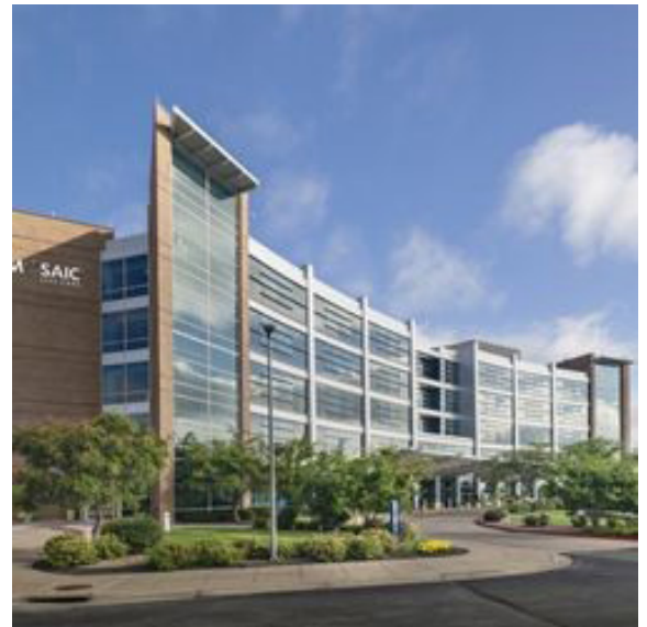
Mosaic Life Care Medical Center