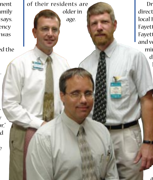
Family Medicine faculty who serve the Fayette Medical Clinic (left to right):