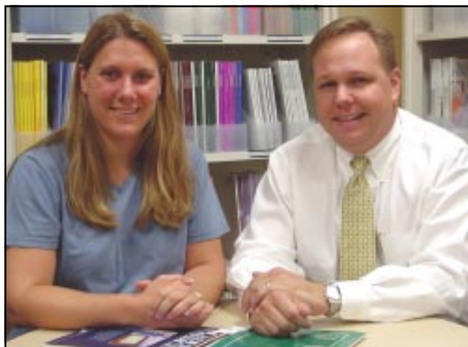
MASTER EDUCATOR FELLOWS